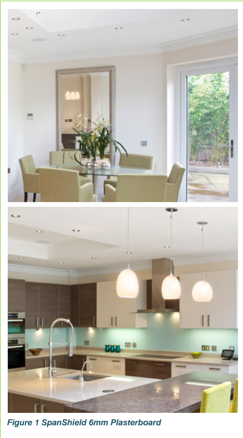
Figure 1 SpanShield 6mm Plasterboard

Knauf business actions are guided by a commitment to sustainable development.